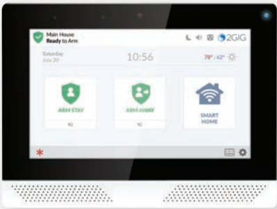
2GIG EDGE Security Panel & Home Automation Hub