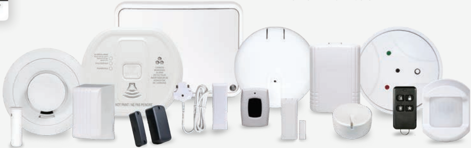
Intrusion, Life Safety & Notification Sensors