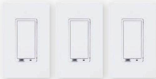
Smart Light Switches