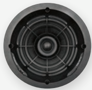
Audio & Entertainment